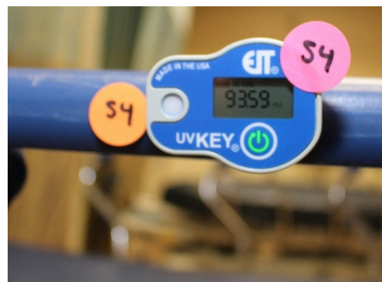
The EIT 2.0 UVKey can be used to easily confirm the numerical dose value of UVC in an operating room (left) and in high touch patient areas such as a bed rail (above)